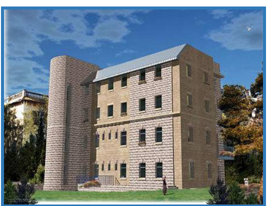
Computer Generated Images