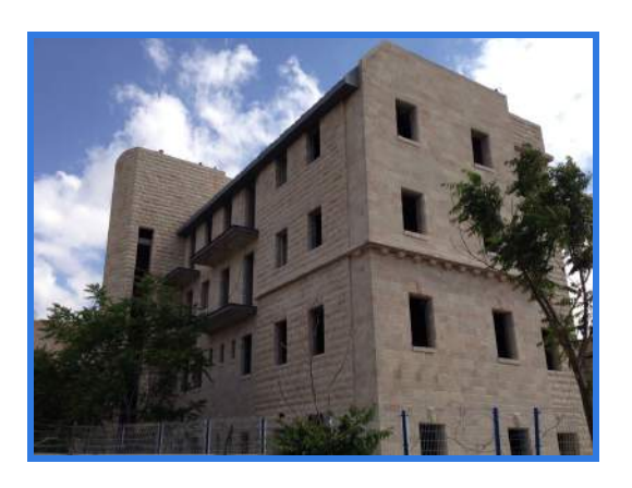
Actual photographs of building in progress